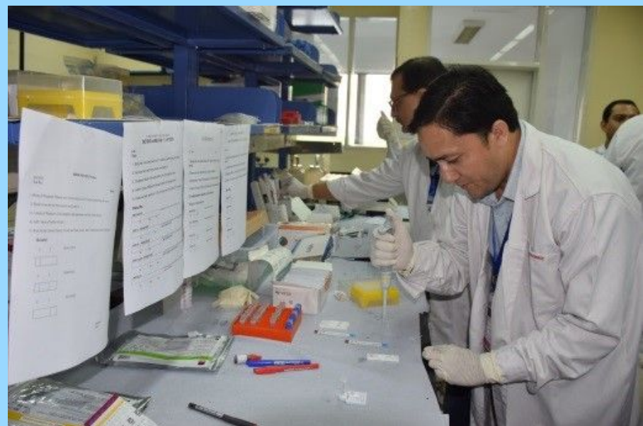
Telangana (29th July-03rd August, 2019) Uttarakhand (26th-31st August 2019)