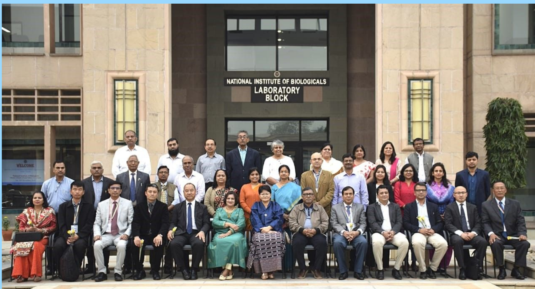
Visit of Hon'ble Health Ministers and WHO Dignitaries from WHO- South East Asian Region to National Institute of Biologicals, NOIDA, (U.P.) India on 20 th November 2019