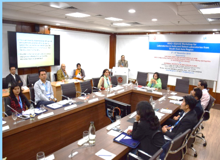
Technical session during the workshop