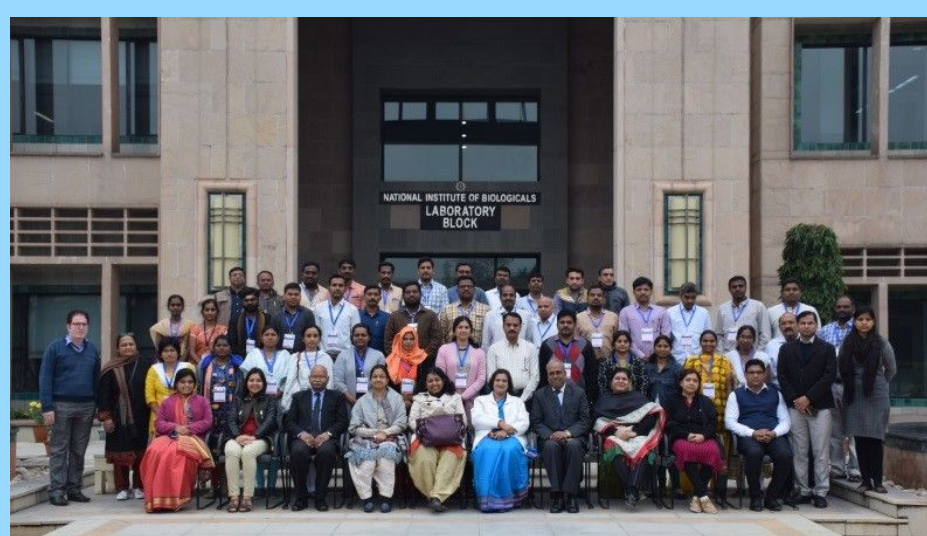
Telangana (16th-21st December, 2019)