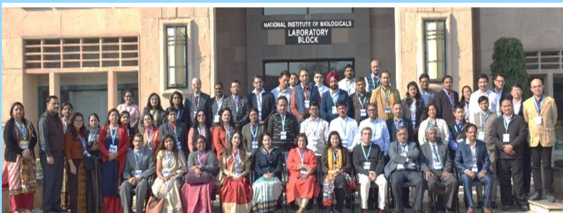
Group photograph of Participants of WHO EQAAS Workshop

A total of 40 participants from laboratories of WHO SEAR (Bhutan, Thailand, India & Nepal), CDLs/DTLs of India, laboratories from 10 states of India under NHM, IPC (Indian Pharmacopeia Commission) and NICED (National Institute of Cholera and Enteric Diseases) participated in the workshop. During the workshop Hands-on Training on EQAAS TTI testing was provided in Immunodiagnostic Kits & Molecular Diagnostic Laboratory (IDKL & MDL), WCC to share technical information about EQAAS, educate the participants to improve performance and encourage them to enhance self-confidence and credibility of the laboratory.