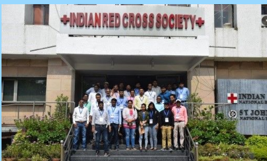
Uttar Pradesh (16th-21st September, 2019)