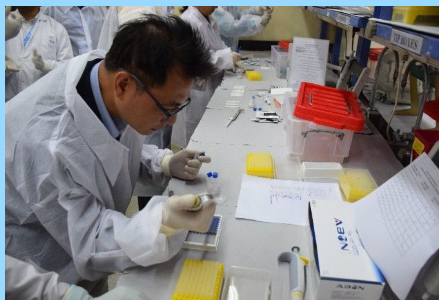
Hands-on Training on EQAAS TTI Testing in Immunodiagnostic Kits & Molecular Diagnostic Laboratory, NIB-WHO Collaborating Centre