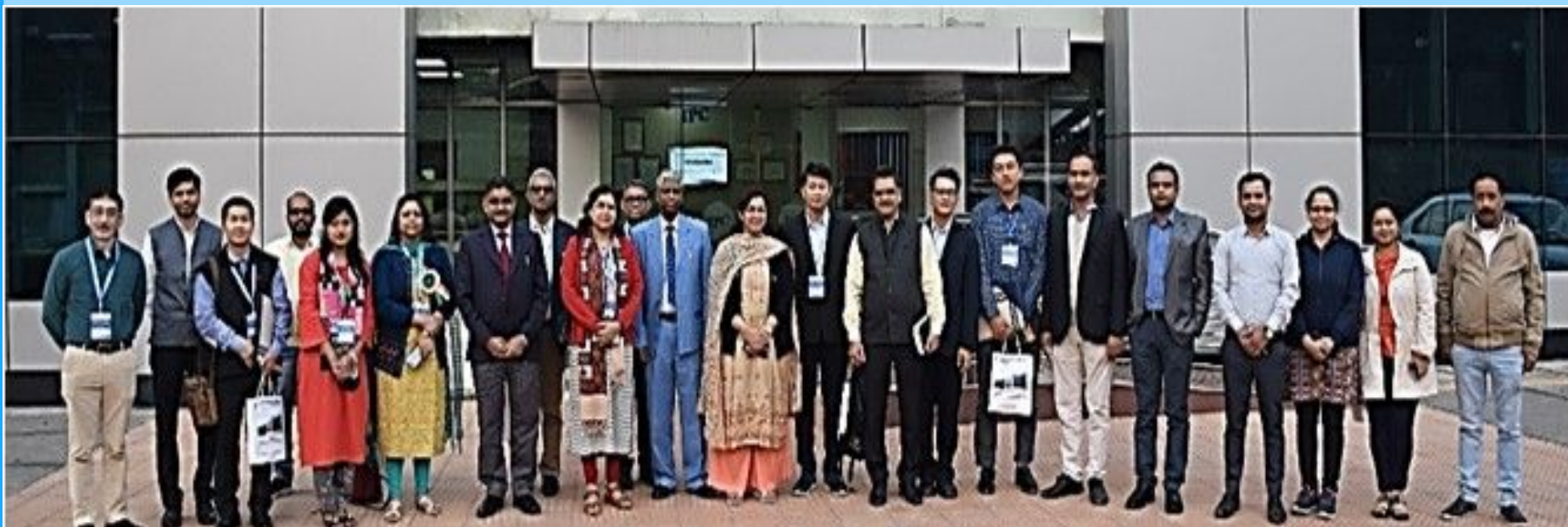
Visit of participants to Indian Pharmacopoeia Commission, Ghaziabad